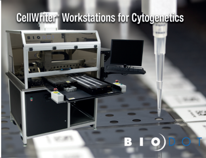
CellWriter™ Workstations for Cytogenetics

HiFISH™ by ASI is a comprehensive digital FISH imaging system, which provides on-screen and accurate computer-assisted analysis for any probe. HiFISH saves nearly 60% in technologists' time, allowing them to focus their expertise where it is needed most.